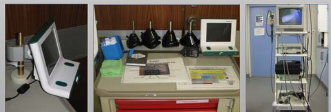
Figure 2 Plug & Play set-up of Ambu®aScope™ versus usual set-up for fiberoptic intubation

Remote sites need to have access to difficult intubation equipment, but the cost of keeping traditional fibroscopes in all these areas is excessive if they are rarely or never used. The occasional user of a fibroscope is often faced with equipment that fails to work as well as it should, and they may lack the skills to troubleshoot fibroscopes and camera stacks; see Figure 2.